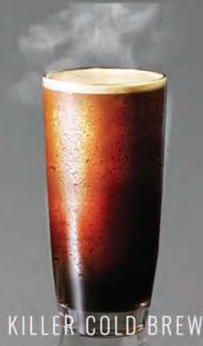
KILLER COLD BREW