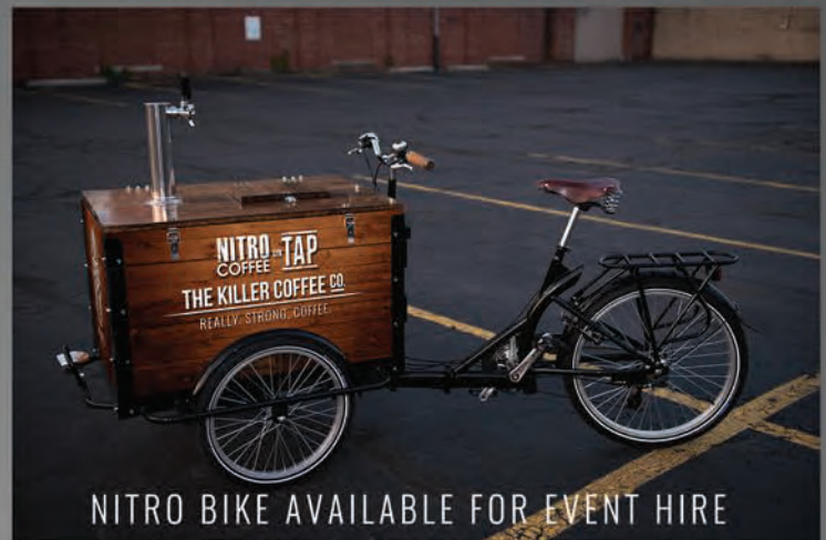
NITRO BIKE AVAILABLE FOR EVENT HIRE