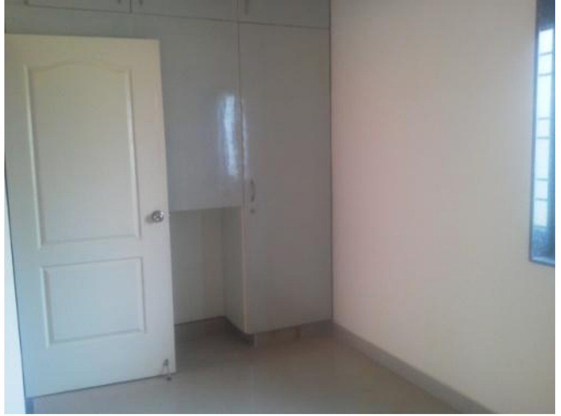
WARDROBE IN MASTER BED ROOM