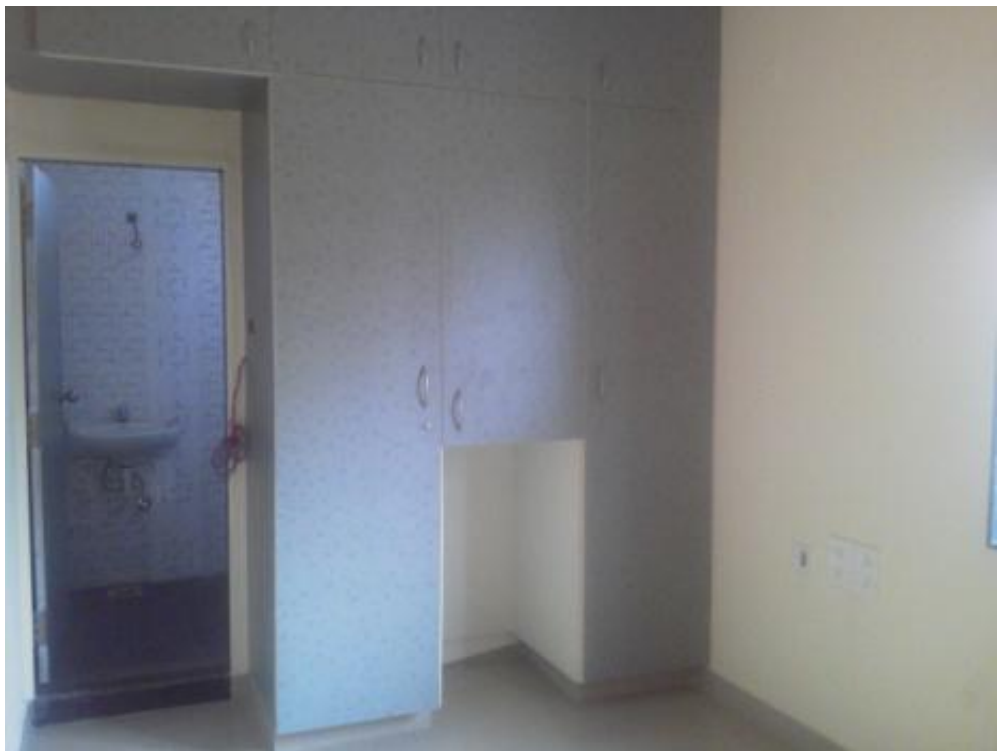
WARDROBE IN CHILDRENS ROOM (BED ROOM-2)